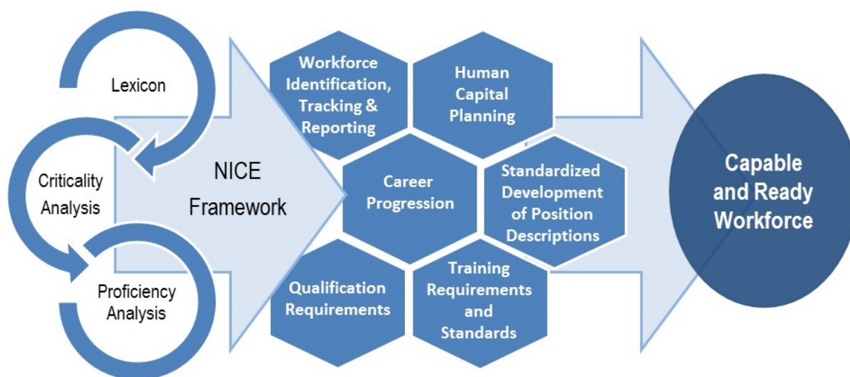
Figure 2 - Building Blocks for a Capable and Ready Cybersecurity Workforce

Figure 2 illustrates how the NICE Framework is a central reference to help employers build a capable and ready cybersecurity workforce.