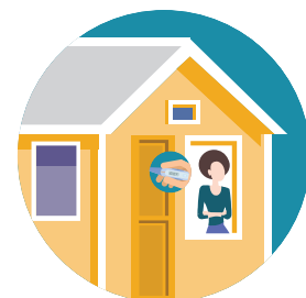
STAY AT HOME IF YOU HAVE SYMPTOMS