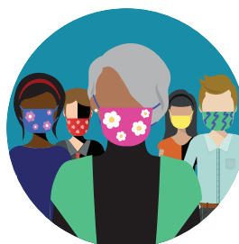
WEAR A FACE COVERING