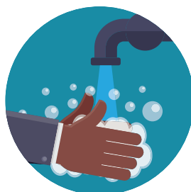
WASH YOUR HANDS OFTEN